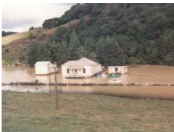
Taitaia Stream in Flood at Camp Sladdin in the 1970s

The Group Barbecue which would have taken place on 29 February at Camp Sladdin, in celebration of Founders Day, had to be cancelled due to bad weather. However, unbeknownst to the leaders busily making the cancellation phone calls, something more sinister was happening out at Camp Sladdin.